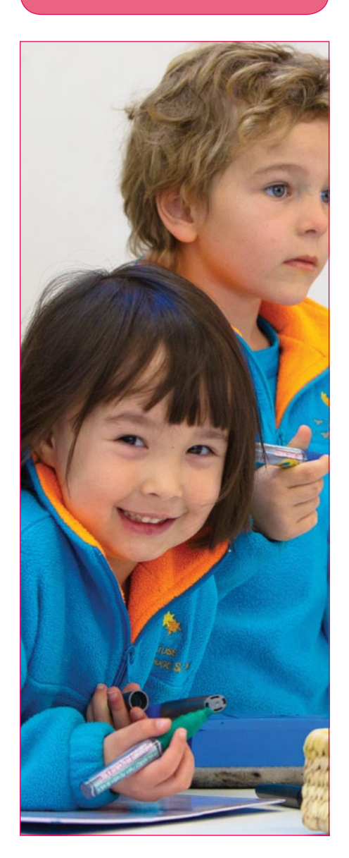
<sup>1</sup>(Belonging, being and becoming: The Early Years Learning Framework for Australia, Department of Education, Employment and Workplace Relations, 2009, p. 13).

When early childhood educators respect the diversity of families and communities, and the aspirations they hold for children, they are able to foster children's motivation to learn and reinforce their sense of themselves as competent learners.<sup>1</sup>